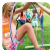
Other Roles Share your gifts!

The Family Ministry Team needs a monumental number of volunteers to host Vacation Bible Camp August 22-26th. Please join us before church May 29th at 9:30 AM to find out more. Let's make this happen for the kids! They've missed a lot these past 2 years and this is your chance to heed the great commission to make disciples AND have fun doing it!