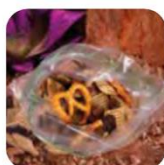
Themed Snacks Ready for 10 AM