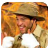
Audio/Visual 9-10 AM and/or 2-3PM