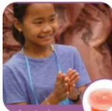
"Scientists" Make gizmos! 2 hours per day