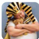
Bible Story 2 hours per day